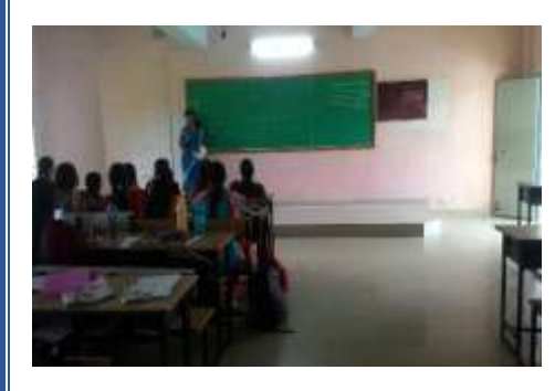
"Verbal and Reasoning Training" by SMART