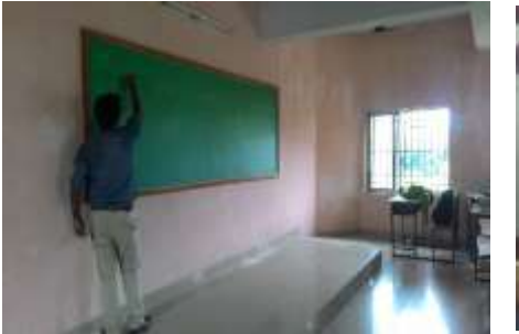
"Aptitude Training by FACE Academy